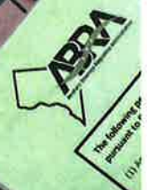
11/5/19 1 st & V Streets SW

THIS SIGN SHALL NOT BE REMOVED, DEFACED, OR DESTROYED UNDER PENALTY OF THE LAW.